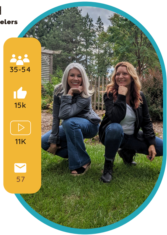
@journeyheretravel Find us on Facebook, Instagram, Pinterest and YouTube.